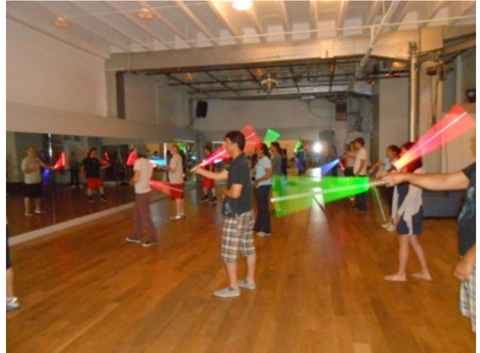
Forward Spin Practice

After stretching, the class is shown how to do the flourishes, which are the fancy sword play of the spins and figures that fighters perform before they engage in battle. The instructors take students through the motions of forward and backward sword spins as well as figure-eight maneuvers and