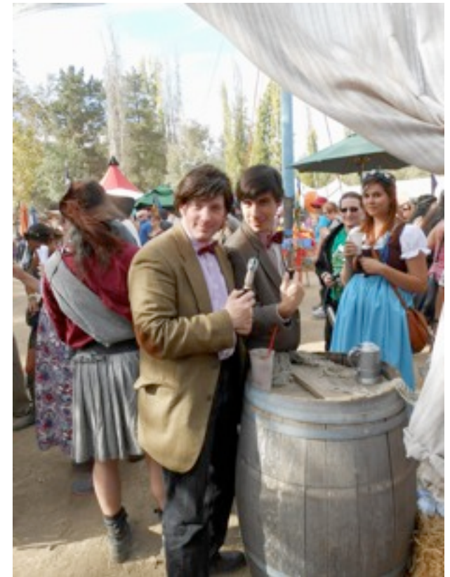
A Pair of Elevens