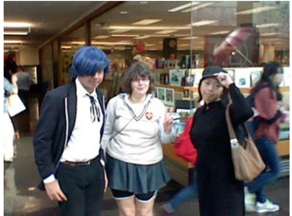
Persona, To Aru Kagaku no Railgun and Durarara!! Cosplayers

Food options were plentiful as well, though not exactly varied. Those willing to spend extra for quality and a show could try to go to Benihana's, although most would find themselves stopping at one of the many Japanese restaurants around the plaza. The amount of places made sure that no one had to wait too long for a meal.