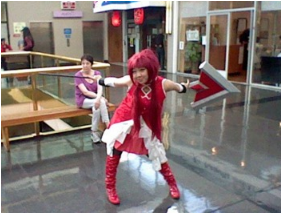
Kyoko from Madoka Magica