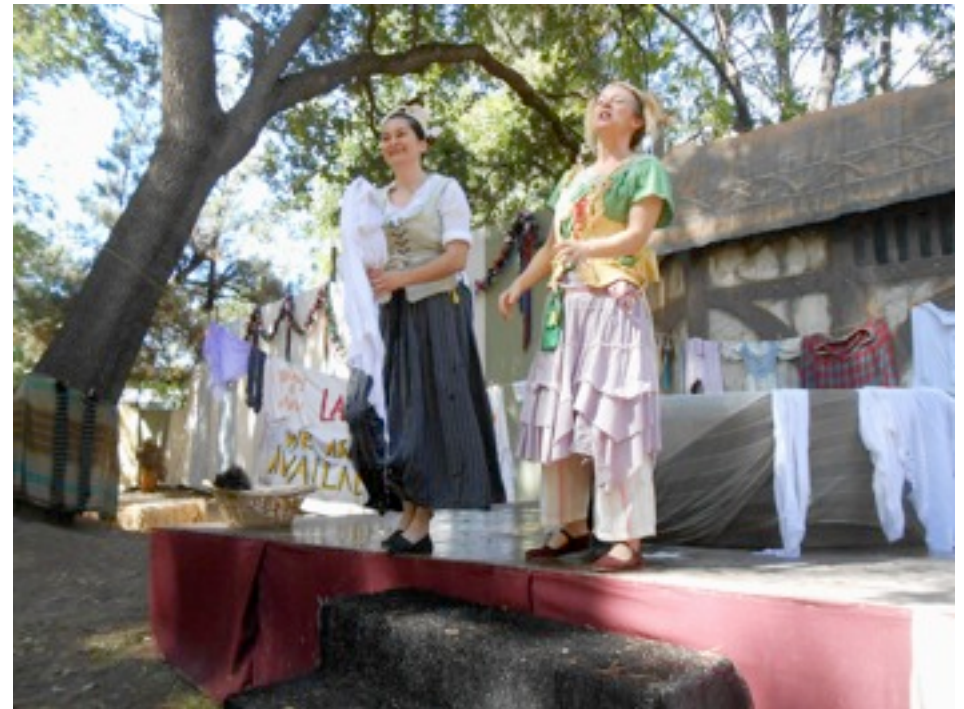
Dirty Laundry Show