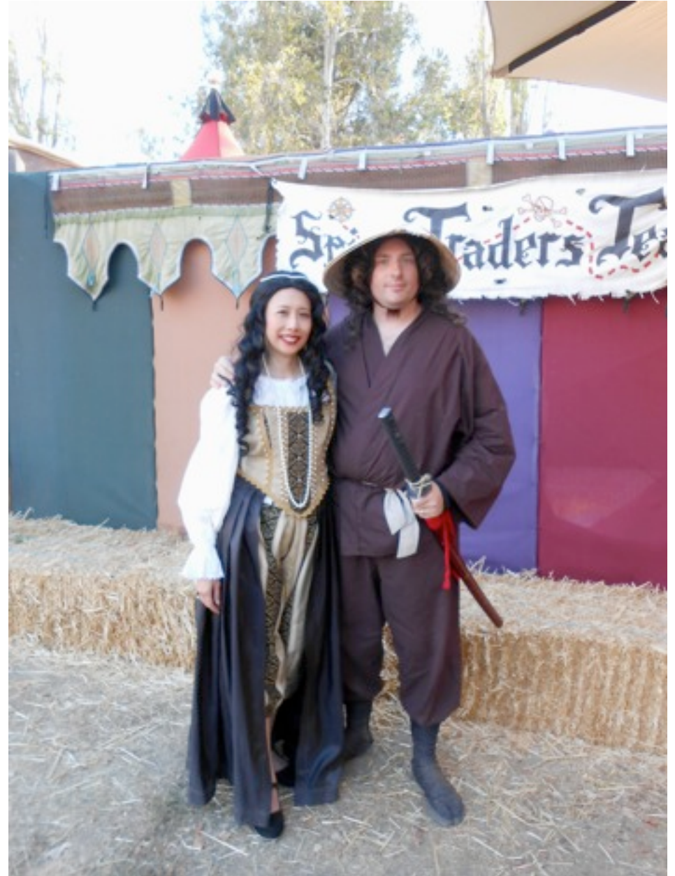
Courtesan and Vagabond

The Northern California Renaissance Faire had many wonderful things to offer this year, with many new attractions and many sights and sounds to enjoy.