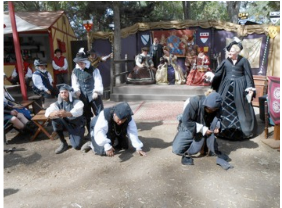
Puritans Performing for the Queen

The one area I did manage to finally view was the Salty Siren Stage at the Dockside Alley. The area is a strictly 21-and-over area due to the adult nature of the show and adult beverages being served in the tavern-like atmosphere. The shows were more risqué and the crowd was much rowdier. I saw three shows in the area: the Merry Wives of Windsor, the Magnificent Humble Boys and Gallows Humor. The Merry