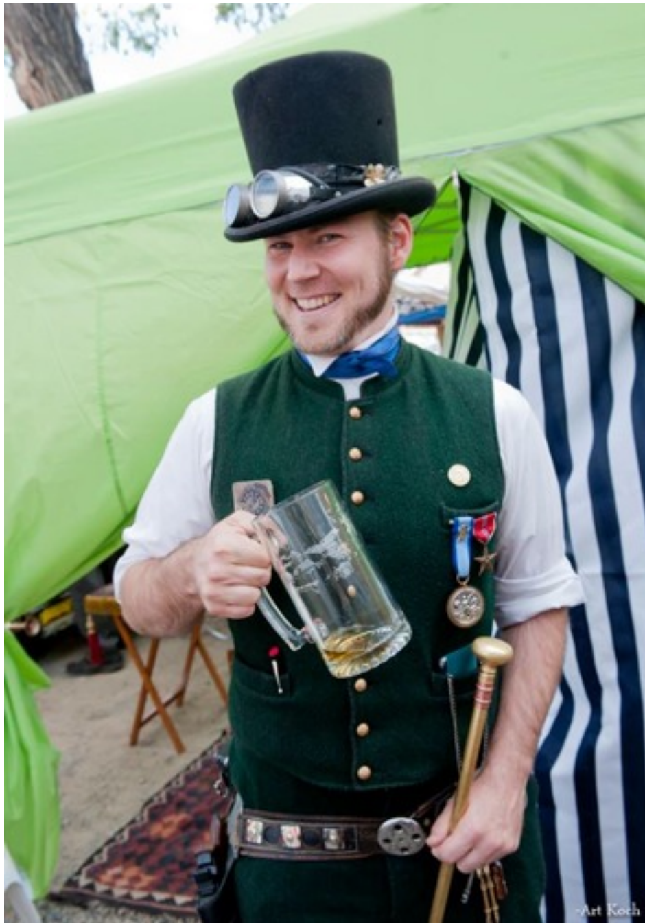
Captain Lucky with Shot Glass