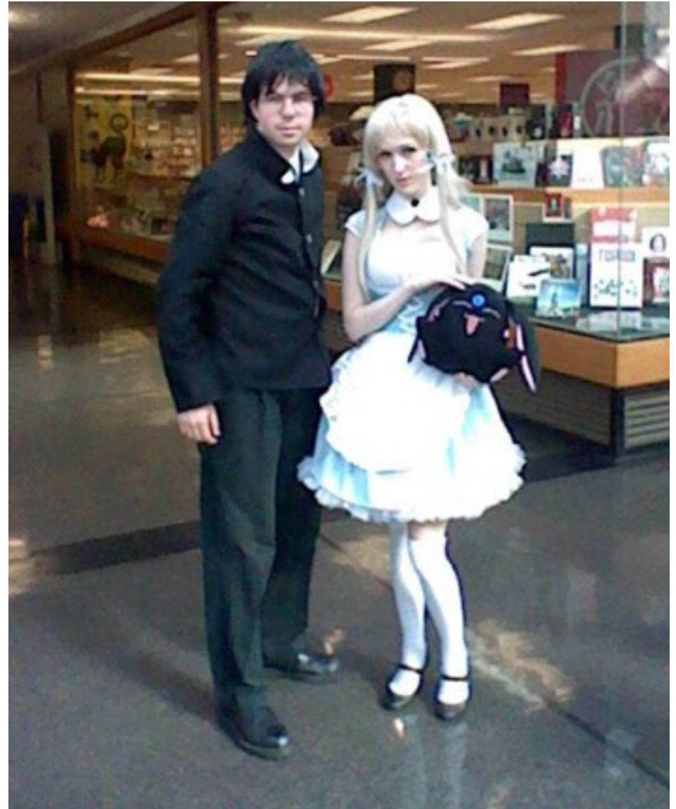
Watanuki and Chii from xxxHolic and Chobits

Outside of the main stage, there wasn't much provided by the event, but there's still plenty to do at Japantown. Most made their way to the Kinokuniya Book Store or Japan Video, before heading to the arcade or shops for things like clothes or swords. There's plenty to do, although not too much as to keep one away from the main events for long.