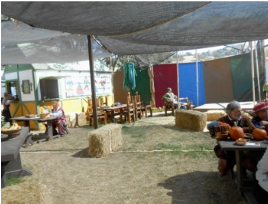
Sitting Area of Friends of Faire Garden