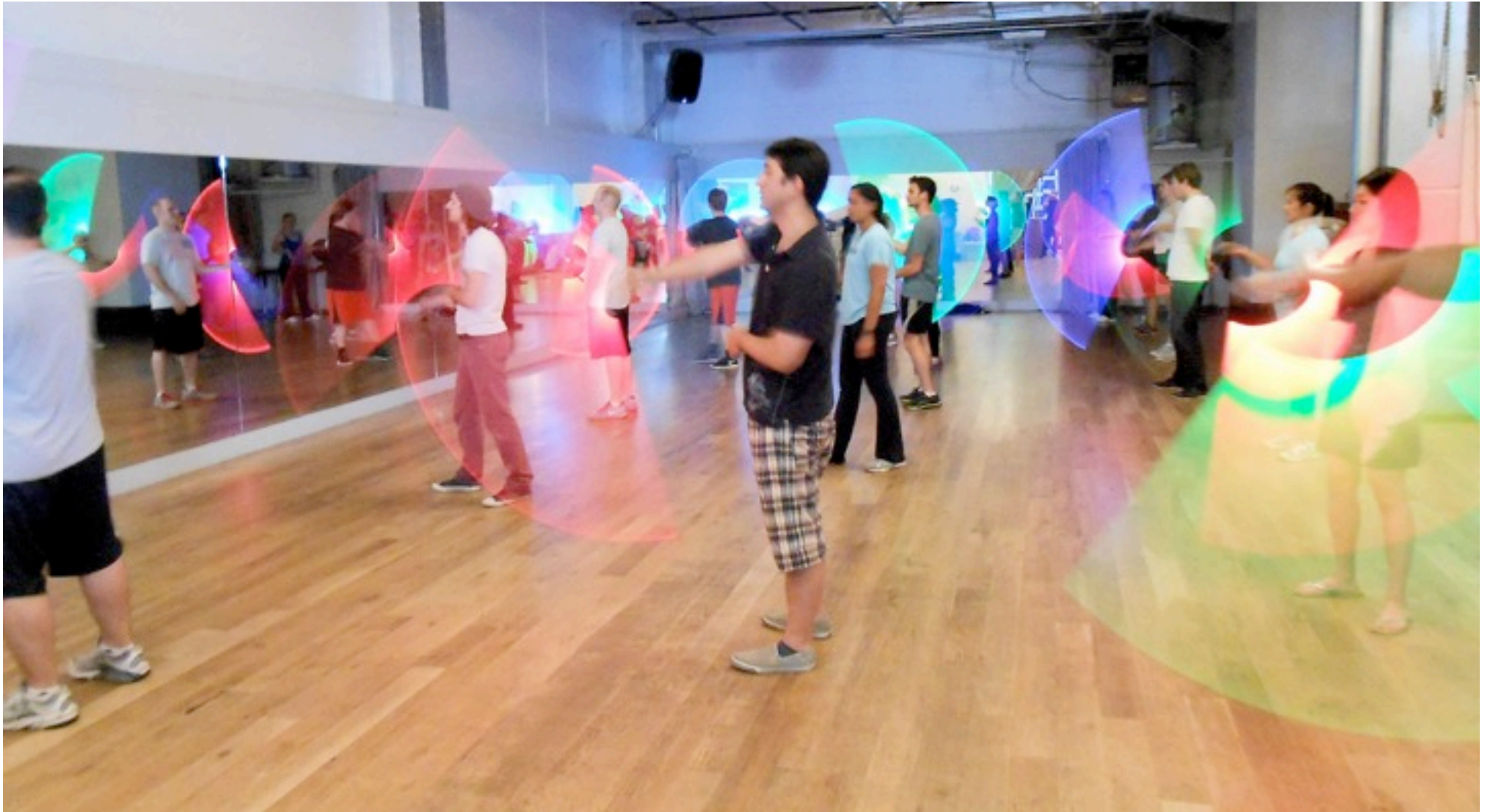
Reverse Spin Practice