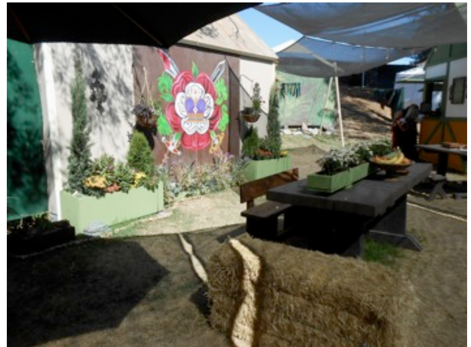
Friends of Faire Sitting Area