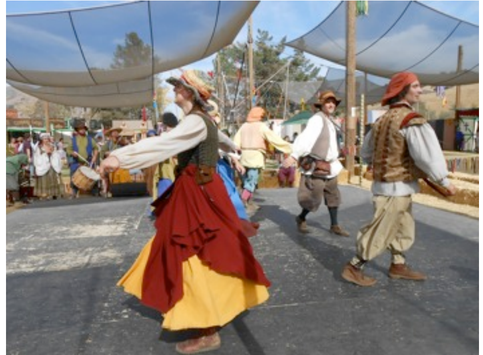
Pipe and Bowl Dancers

Another entertainment that I caught was the performing troupe Last Call. They performed at the Coughing Sheep Tavern Stage and sang songs of drinking and merriment at the close of one day. It was a great way to cap off the day with songs about drinking so you can have “one for the road” without actually drinking.