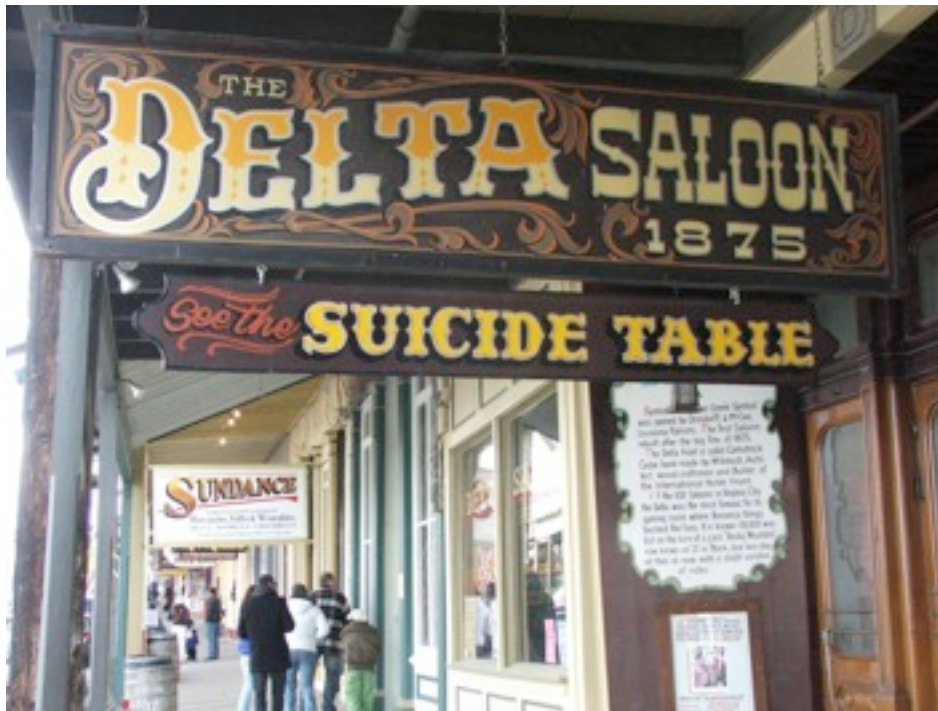
Suicide Table Saloon