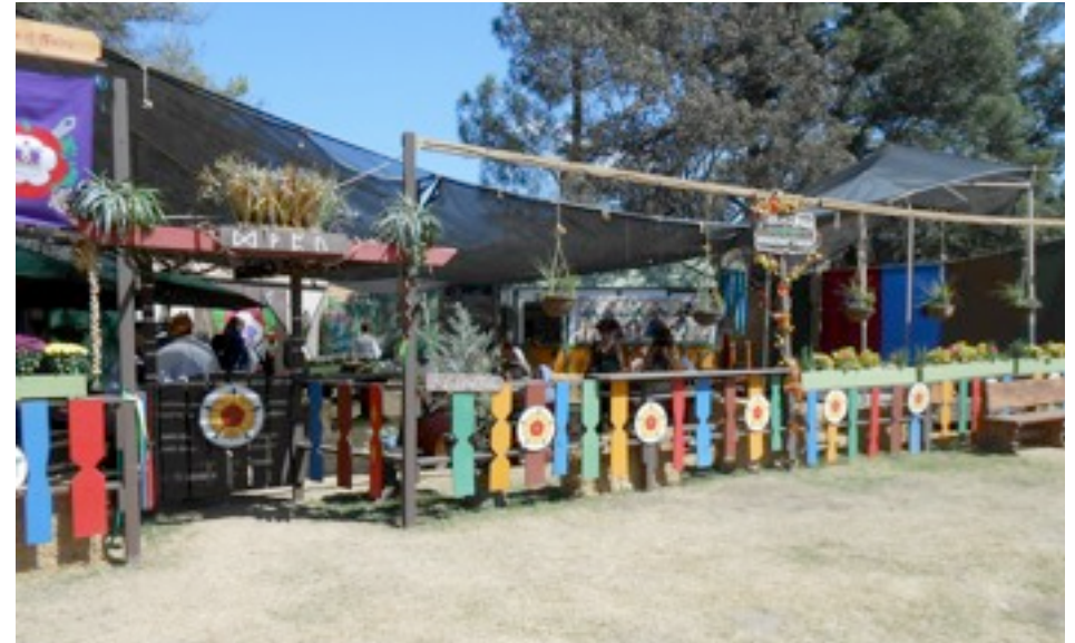
Friends of Faire Garden

There was also a new Friends of Faire Garden. The garden was moved to rear of the food court area. Tours were conducted for everyone to see. There was a nice shaded area with a mister to cool everyone down, colorful plants to give it a calm, serene feel, and beautiful decorations and murals depicting the Tudor Rose and dancers. The fencing had colorful slats with a Tudor Rose painted on the gate. Amenities were available for the membership price of $30 such as free snacks (pickles, pretzels and peanuts), drinks (ice, water and Gatorade), clean privies, discount soft drinks, a parcel check and other items.