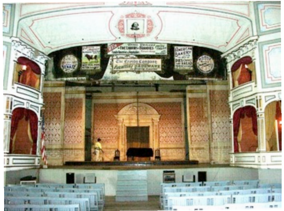
Piper's Opera House Interior

To find out more about Captain Lucky's adventures in Nevada, listen to Aethercast 007: The Cat Houses of Nevada ( aetherbrigade.com/Steamcast-007/ ).