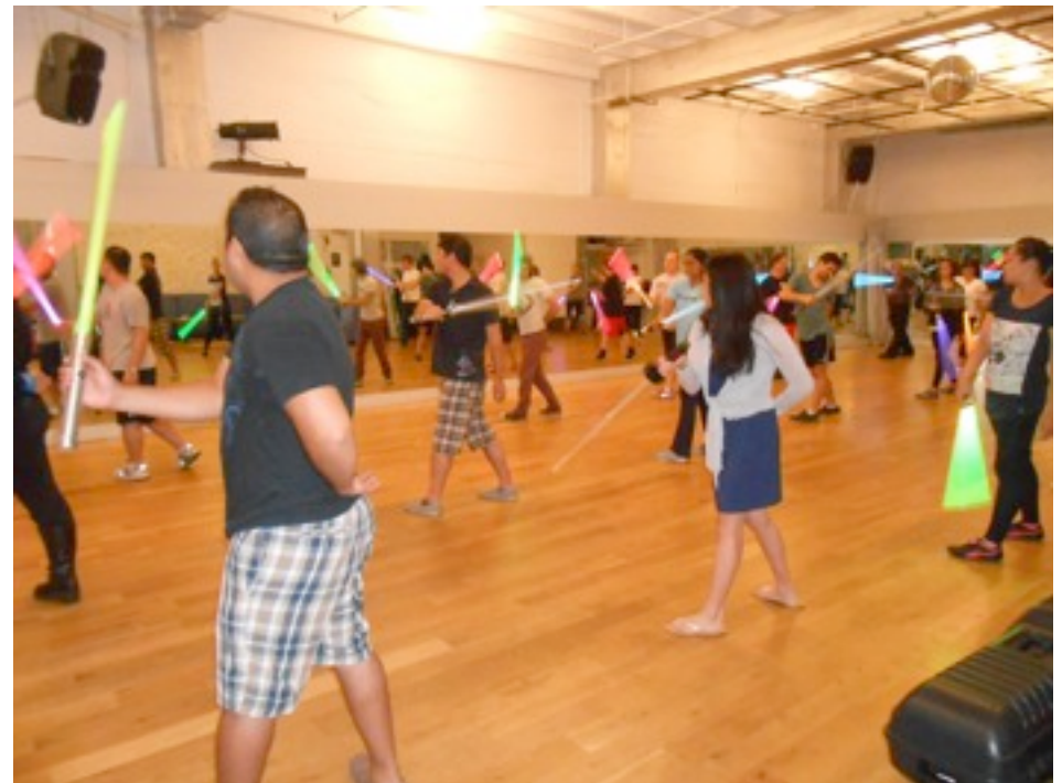
Figure Eight Flourish