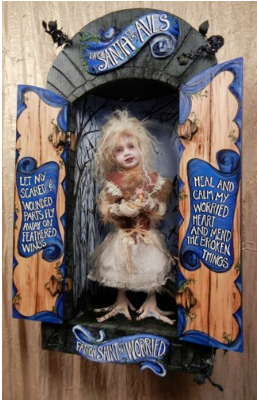
La Santa De Las Aves by Stefanie Vega