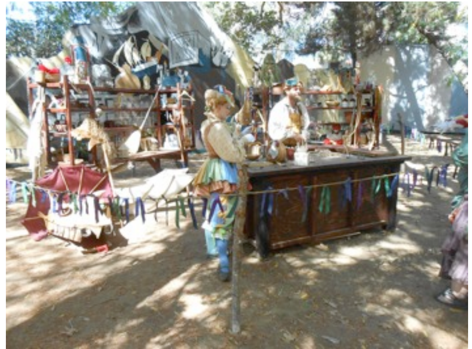
Story Maker Booth

The washing well near the entrance is always a fun visit where you see the peasants plying wares that most people