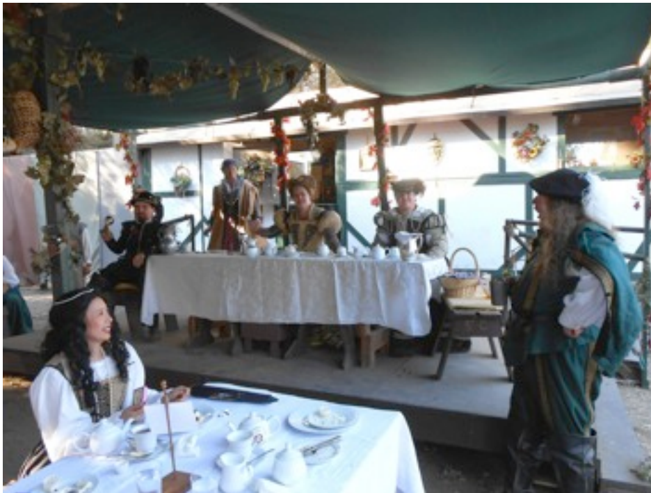
Tea With Queen Elizabeth and Shakespeare

Certainly, one of the big draws for the faire is the shows. There are always numerous shows to see throughout the run of the faire. There are plenty to watch even if you just go for a single day. I actually managed to catch a number of them from the run of this season. The main one that I finally saw after several missed opportunities was the Dirty Laundry show. The