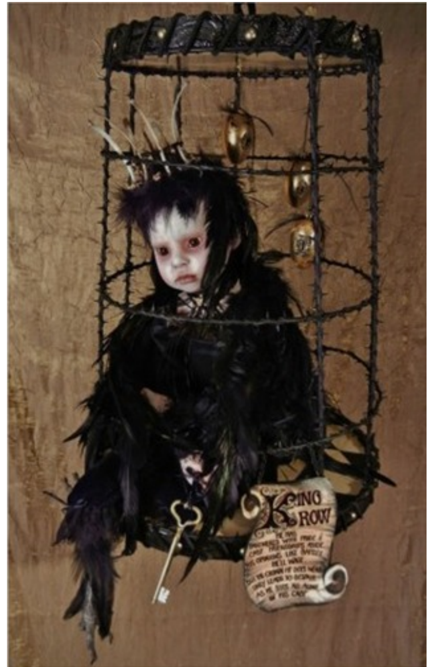
King Krow by Stefanie Vega