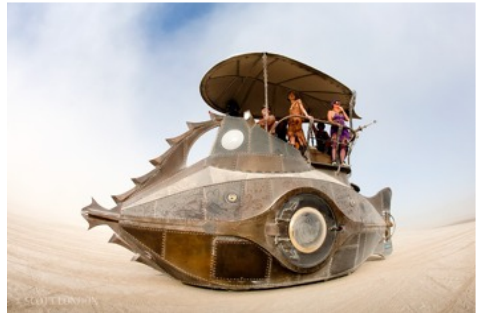
Nautilus Submarine Car at Burning Man

There were many talented musicians and the stage show segued nicely into the ball itself. Slow Djinn Fez played some rather complex instrumentals and Unwoman capped off the evening with her ever-haunting melodies. I particularly enjoyed 6 Mule Pile-up, a bluegrass band composed entirely of young and handsome folks of both sexes that put me in mind of the soundtrack of "O Brother, Where Art Thou?," not only were they a pleasure to look upon, but I found my toe tapping in spite of the old ghoul bite acting up! (I cannot recommend 6 Mule Pile-up too highly!)