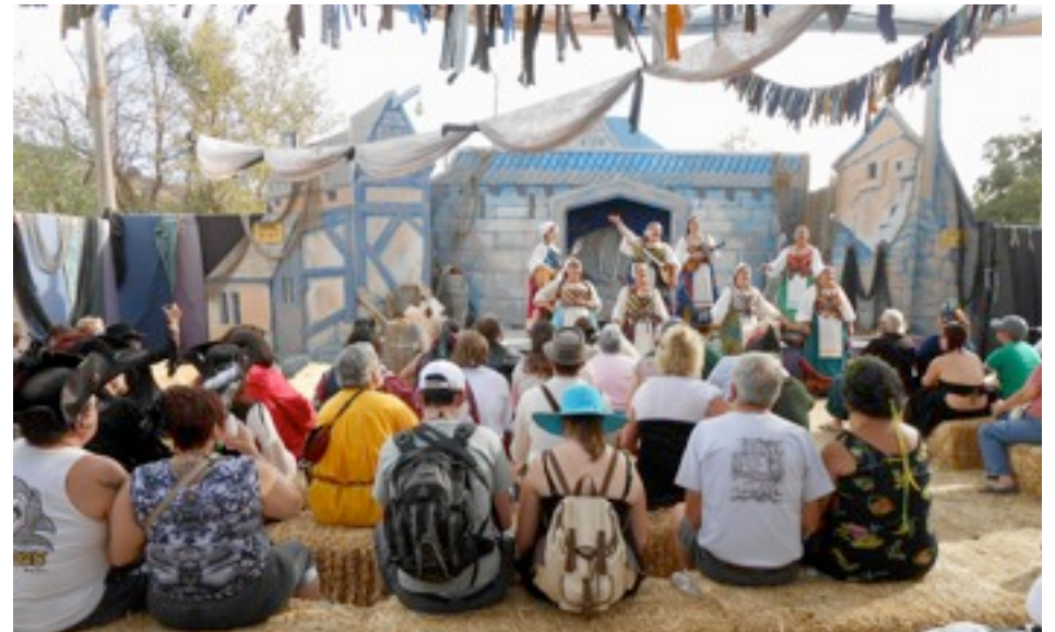
Salty Siren Stage