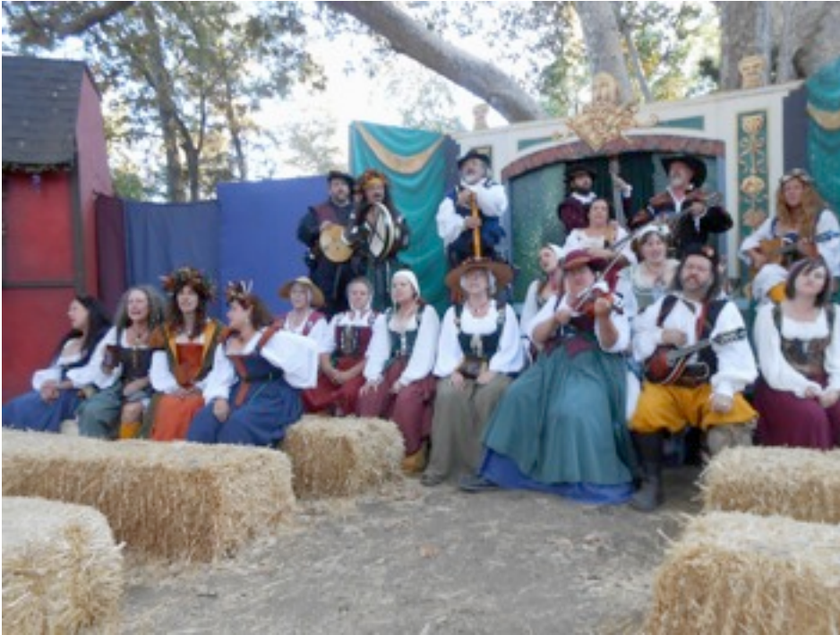
Last Call Performing